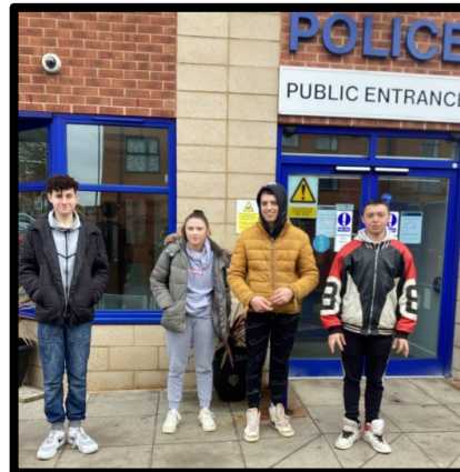
The Sand Martins ready to learn about careers in the Police Force.