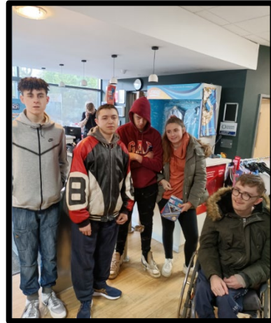
The Sand Martins excited for their tour of a local Gym.