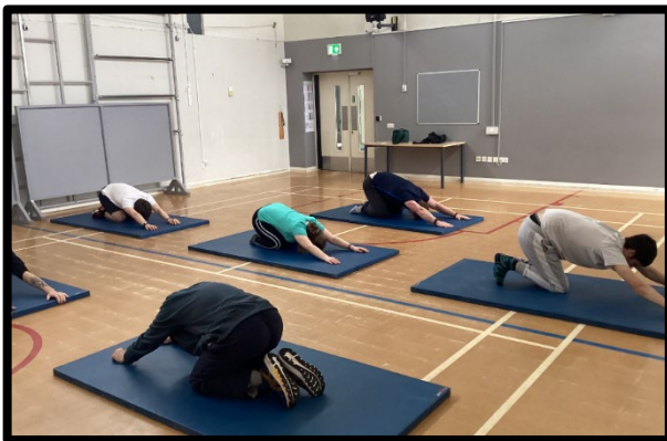
The Den stretching off before their lesson begins.