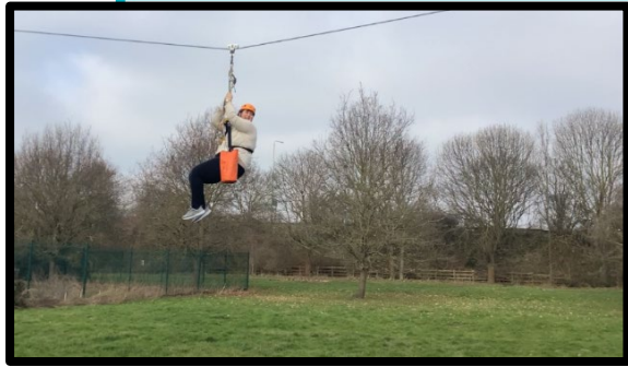
Poppy H holding on tight, using the zip-line at the Outdoor Pursuits Centre.