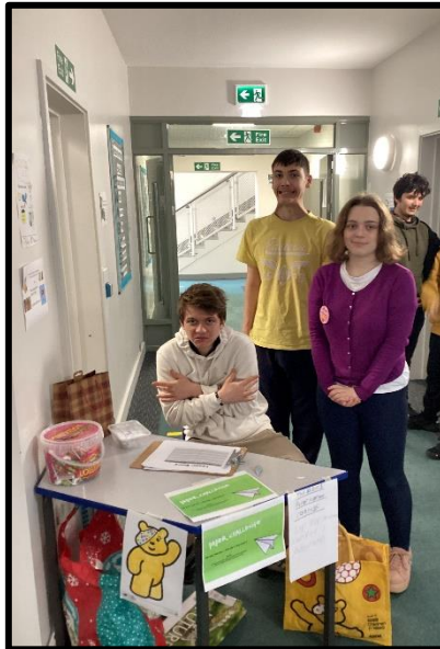
The Den during the Rickshaw Challenge.