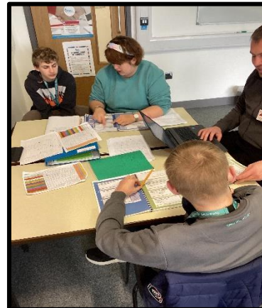
The Swifts working on their ASDAN Maths work.