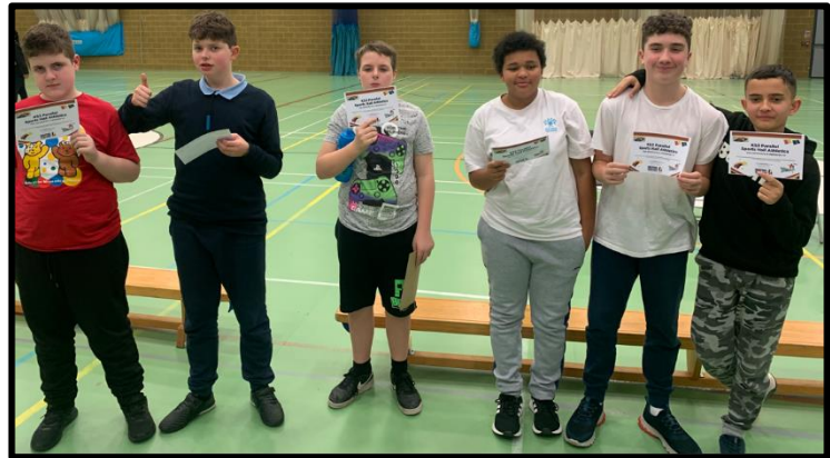
Young people from The Yard and 7LC celebrating their certificates at the KS3 athletics competition.