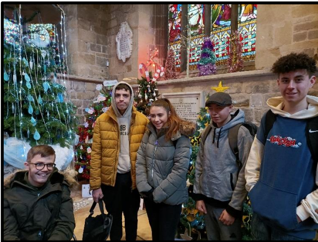
The Sand Martins at the Christmas Tree Festival.