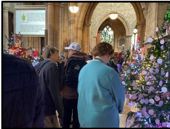
The Swifts at the Christmas Tree Festival.