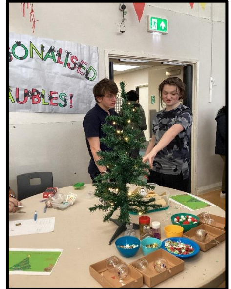
The Den during the Christmas Bazaar.