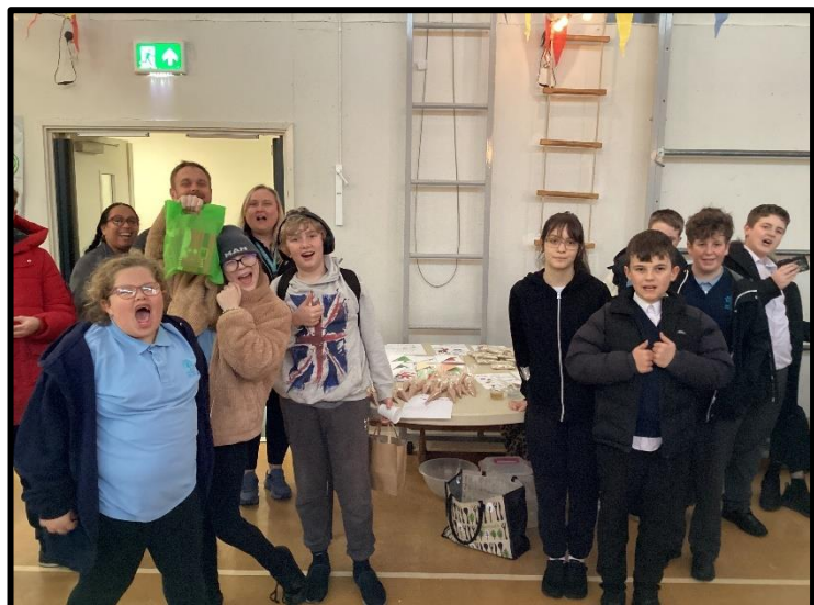
The Yard at the Christmas Bazaar, where their hard work raised £128 for the class!