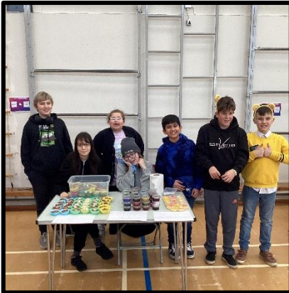
The Yard at the Rickshaw Challenge.