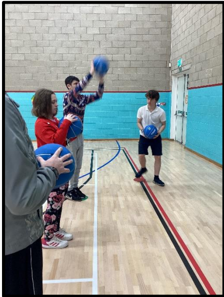
The Den during their End of Block "Shoot out" competition.