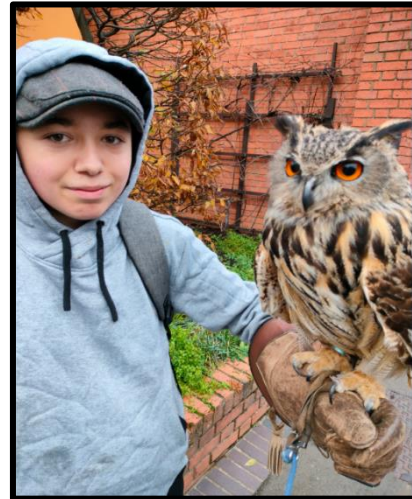
Kale, making friends with an Owl and showing no fear.